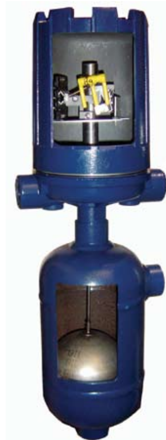
Typical Level Switch