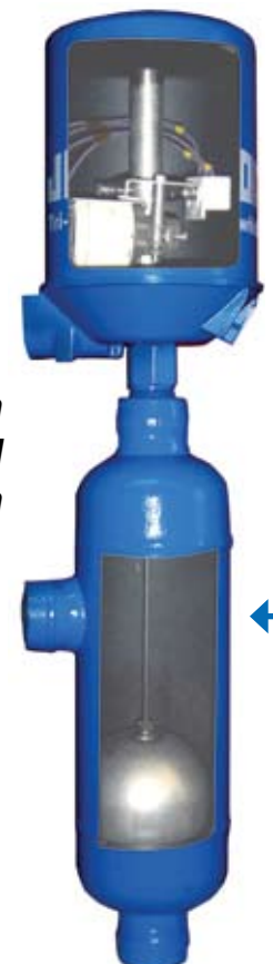
Jerguson Tri-Magnet Level Switch